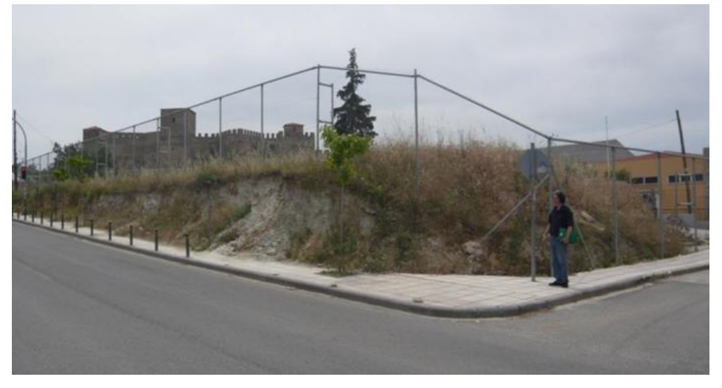
Before. Undeveloped area (view from the main road). At the back: the Eptapyrgio monument.

1st/2nd Public High School, located near the historical monument of Eptapyrgio. Municipality of Sykies, urban agglomeration of Thessaloniki/1.