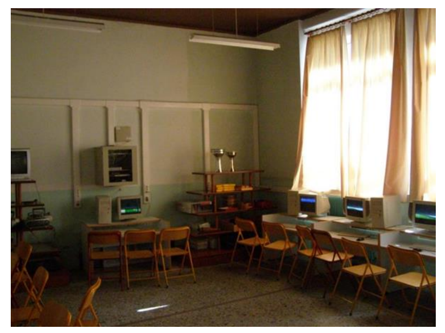
Before. A computer classroom.

9<sup>th</sup> Public Primary School in the city of Kilkis, Northern Greece