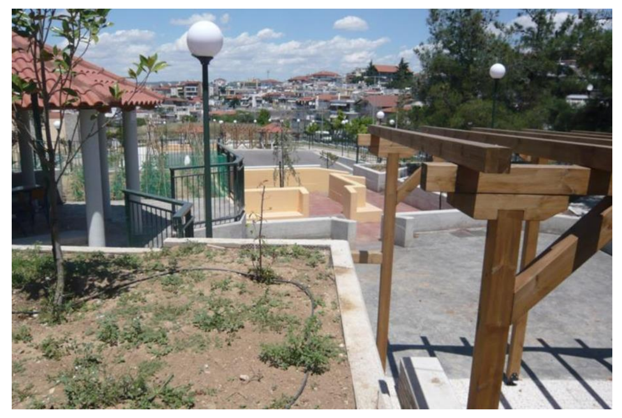
After redesign. From the same point of view, areas for education and leisure activities.

Before. The unformed space and in the background the city.