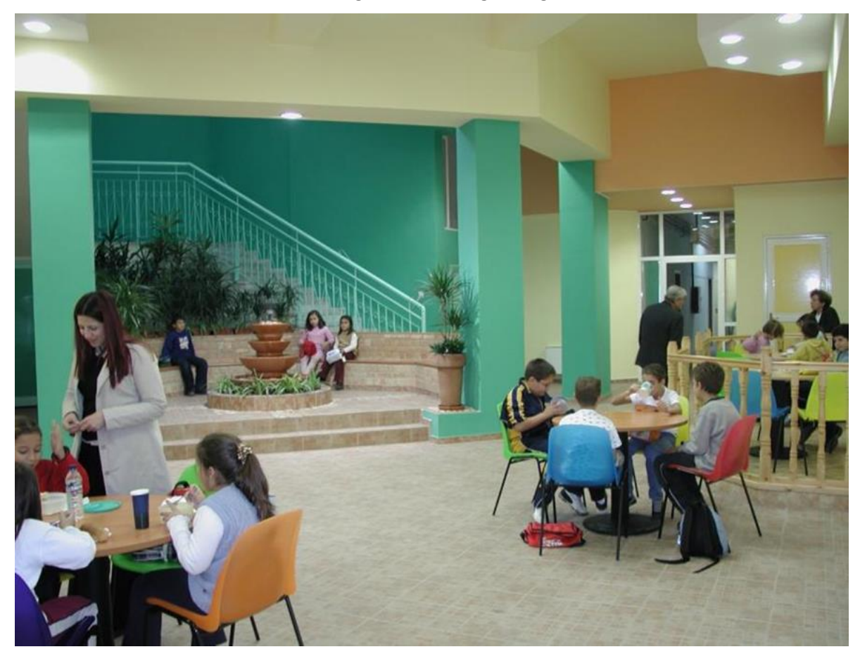
Before. The main hall, with visible heating and fire extinguishing facilities.

After redesign. Alternative activities hall, functioning for group activities, drama activities, art exhibitions, debates, leisure activities and lunch area.