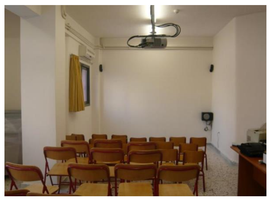
Before. Surplus classroom available for parent club meetings.

4<sup>th</sup> Public Primary School, Municipality of Menemeni, urban agglomeration of Thessaloniki.