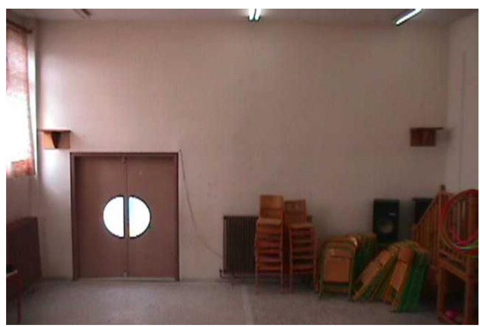
ECSC attached to the Public Primary School of Chrysavgi, Langadas, Northern Greece/2