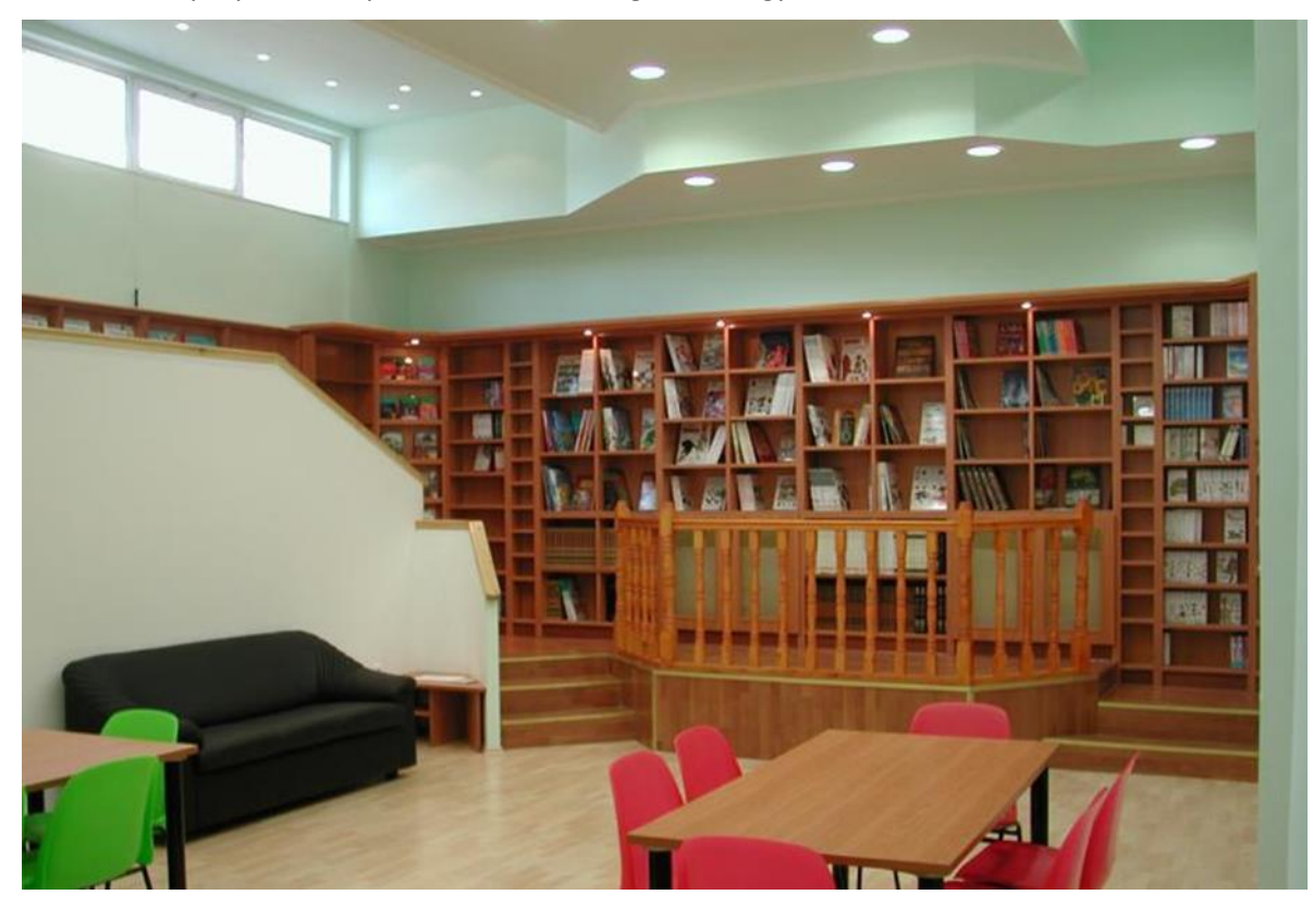
Before. Multipurpose hall, planned as a meeting hall and gym.

After redesign. Multipurpose hall, functioning alternately as school library and study room or as art and culture hall.