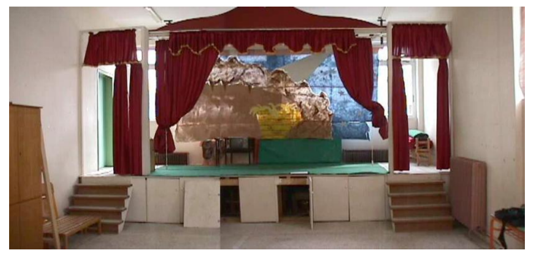
Before. A meeting hall, an ugly and depersonalized school space.

ECSC attached to the Public Primary School of Chrysavgi, Langadas, Northern Greece/1.